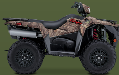
True Timber Kanati

The KingQuad 750AXi Power Steering SE Camo is not just an ATV, it's a KingQuad ATV. Suzuki, the inventor of the 4-wheel ATV, has created the world's best sports-utility quad with bold styling plus more capability and reliability than ever before. The legacy of the iconic KingQuad remains fresh and exciting and is ready for riders to join its history. Ready for outdoor adventure, the 2025 KingQuad 750AXi Power Steering SE Camo helps tackle challenging terrain with the capabilities that only a KingQuad possesses.